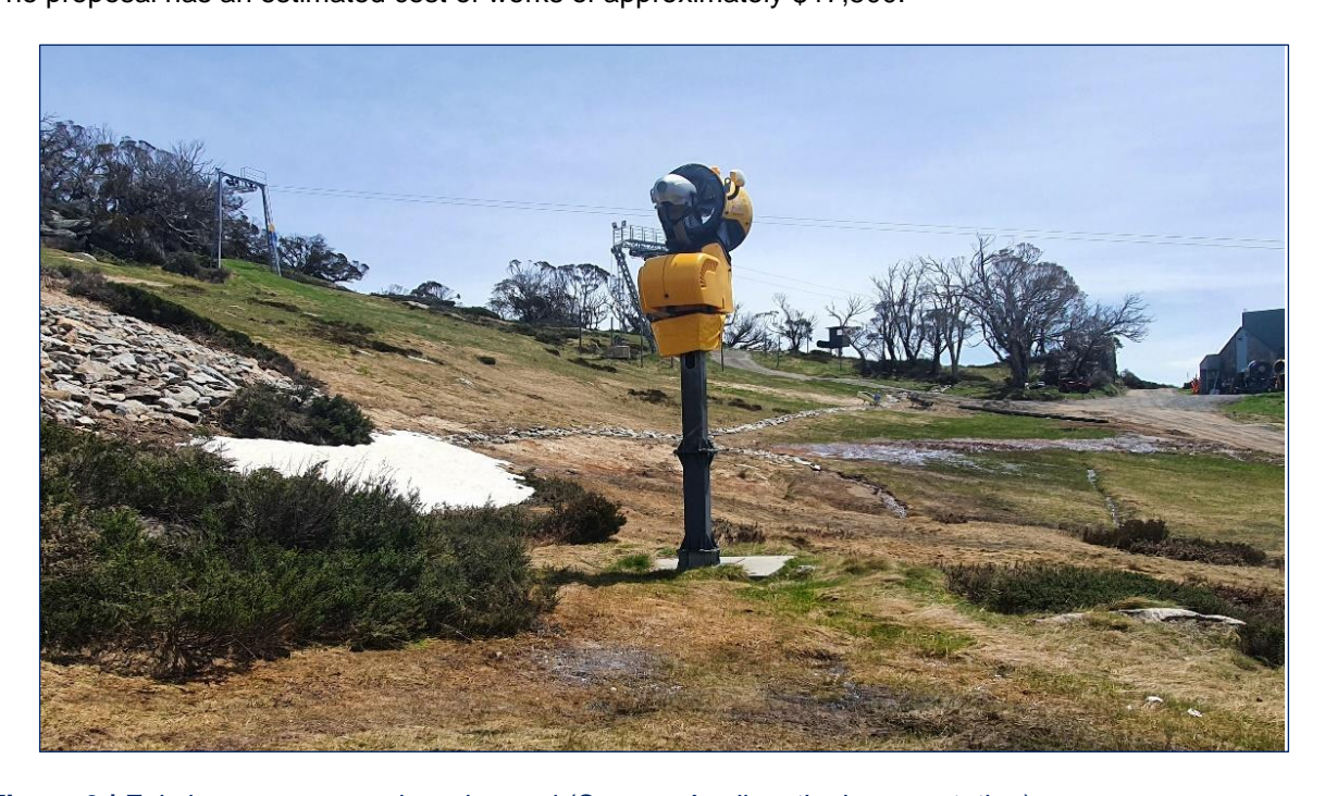
Figure 3 | Existing snow gun to be relocated.

The proposal has an estimated cost of works of approximately $17,500.