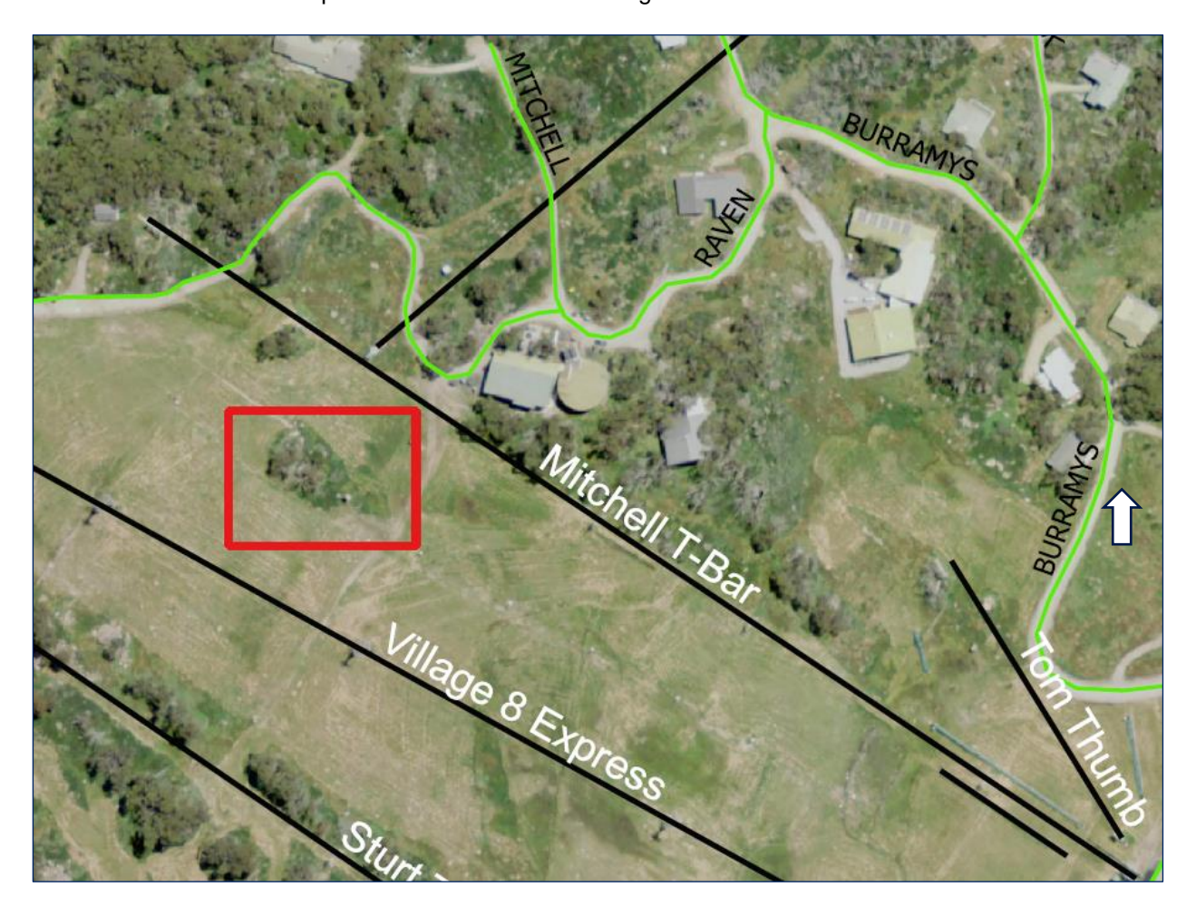
Figure 1 | Site (highlighted) in context of Front Valley and adjoining areas

The Applicant is seeking approval to relocate a snowmaking fan gun uphill from an existing position at the bottom of a depression ( Figure 1 ). Moving it to the knoll area above its current location is to make it more visible and ensure it is an optimal location for snowmaking.